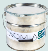
Bucket 12 l

A part of the cadMIX package are the necessary accessories that allow you to start working immediately.